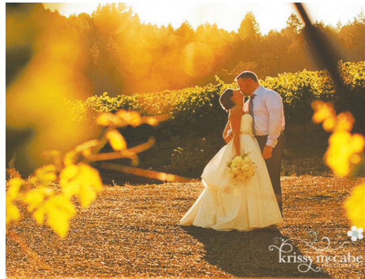
Top location: Calistoga, Theme: "Love Amidst the Vines". Location at right: Old St. Hilary's, Tiburon, Theme: "Going to the Chapel".

This will allow you to see what your partner has been dreaming about. Once armed with this information you will both be able to craft a shared vision for this grand day.